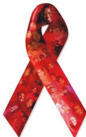
Trends in HIV/AIDS, Connecticut, 1980-2006